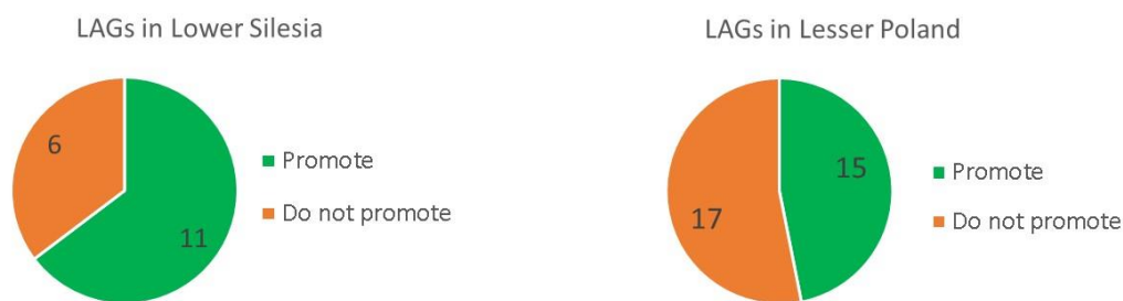
Figure 2. Number of LAGs from the Lower Silesia and from Lesser Poland provinces, which consistently promoted local food producers on their websites.

The most frequently promoted products included vegetable and fruit preserves, honey, bakery products, confectionery, sometimes delicatessen products such as dumplings, less often local wines. The LAGs from Lower Silesia which promoted a local product, listed between 4 and 37 producers along with their products. LAGs from Lesser Poland – between 3 and 23 producers along with their products. In six LAGs in Lower Silesia local products (dishes) were promoted in eating establishments, while in the Lesser Poland – in seven LAGs. Five LAGs from Lower Silesia and a single LAG from Lesser Poland offered direct links to the homepages of the local producers they promoted.