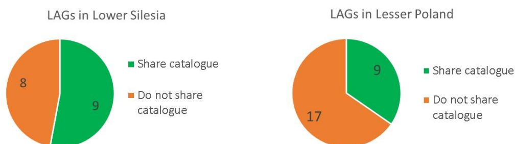
Figure 3. Number of LAGs from Lower Silesia and from Lesser Poland, which made available on their websites a catalogue of local products in the form of a document file.

Various types of catalogues listing producers or local products were offered for download by nine LAGs from Lower Silesia (52%) and another nine from Lesser Poland (only 28% of all LAGs from this province) (Figure 3). Most often these catalogues were prepared in the form of a document in the Adobe pdf format and printed in colour. They usually included not only food products but also crafts, and often also local services. The catalogues enabled direct contact with the producer in order to purchase their products.