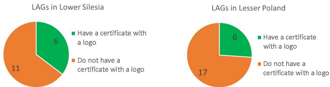
Figure 4. Number of LAGs from the Lower Silesia and from the Lesser Poland which informed on their websites about having granted a local product certificate with its own logo.

In Lower Silesia the largest number of certified food products were offered on the local market by the "Ślężanie" LAG, the "LAG for sustainable development of the municipalities of Kąty Wrocławskie, Kobierzyce, Siechnice, Żórawina, Domaniów – Leader A4" and "Partnerstwo Doliny Baryczy (Partnership for the Barycz Valley)". For example, the Partnership for the Barycz Valley has developed the local brand "Dolina Baryczy Poleca (Recommended by the Barycz Valley)" (Figure 5). It is one of the better functioning territorial partnerships located in a fishing region (Glinka, 2015; Raftowicz et al., 2021; Tokarczyk-Dorociak et al., 2016). The products are promoted on the LAG's website, where one can find a description of each product, including its distinguishing features, how friendly it is towards the environment and the customer, as well as information on wholesale and retail sales (including the manufacturer's contact details). The producer can directly apply for a slot in the "Products and services from the Barycz Valley region database", free of charge.