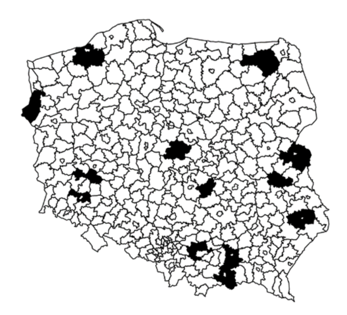
Figure 1. Spatial scope of empirical research

The study was conducted among farmers' households in Poland in the period: October 2019 – March 2020. The size of the group was 480 people, including agricultural producers from six voivodeships in Poland (Figure 1).