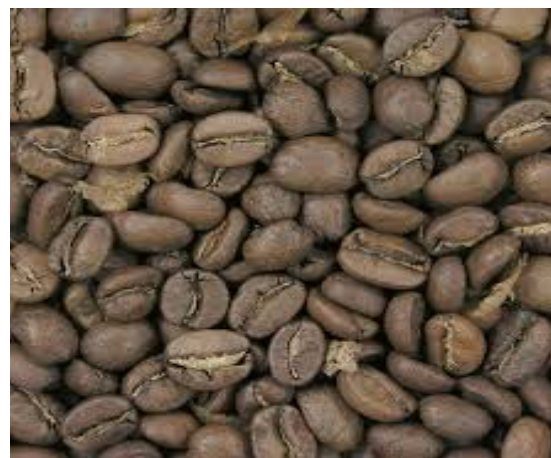
Fig. (1). Roasted coffee beans.

Roasted coffee beans are brewed to prepare coffee (Fig. 1). These beans are extracted from the Coffea plant, which is found in tropical Africa. The production of coffee beans was at some point in history exported to the rest of the world, and now more than 70 countries are producing it themselves. The Arabica and Robusta are the two strains that are typically grown, with Arabica being the more popular of the two. The Robusta is less in demand, despite being stronger in taste and impact. Coffee, the most popular beverage in the world, is loaded with caffeine [1]. Another extremely popular beverage containing caffeine is a variety of tea, and we must not forget the fast-growing production of caffeine-containing energy drinks. Caffeine stimulates the central nervous system because it is a bioactive compound. For this very reason, it has positive impacts on an individual's long-term memory [2].