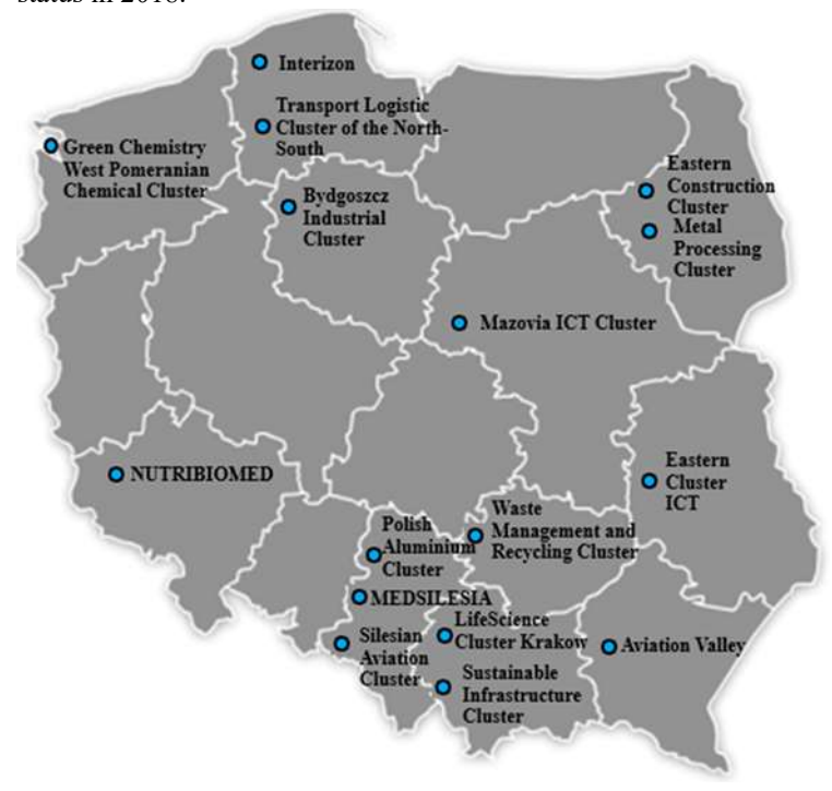
Fig. 2. Key National Clusters in Poland (end of September 2018).

at the end of September 2018 and is addressed to those key clusters that lose their key status in 2018.